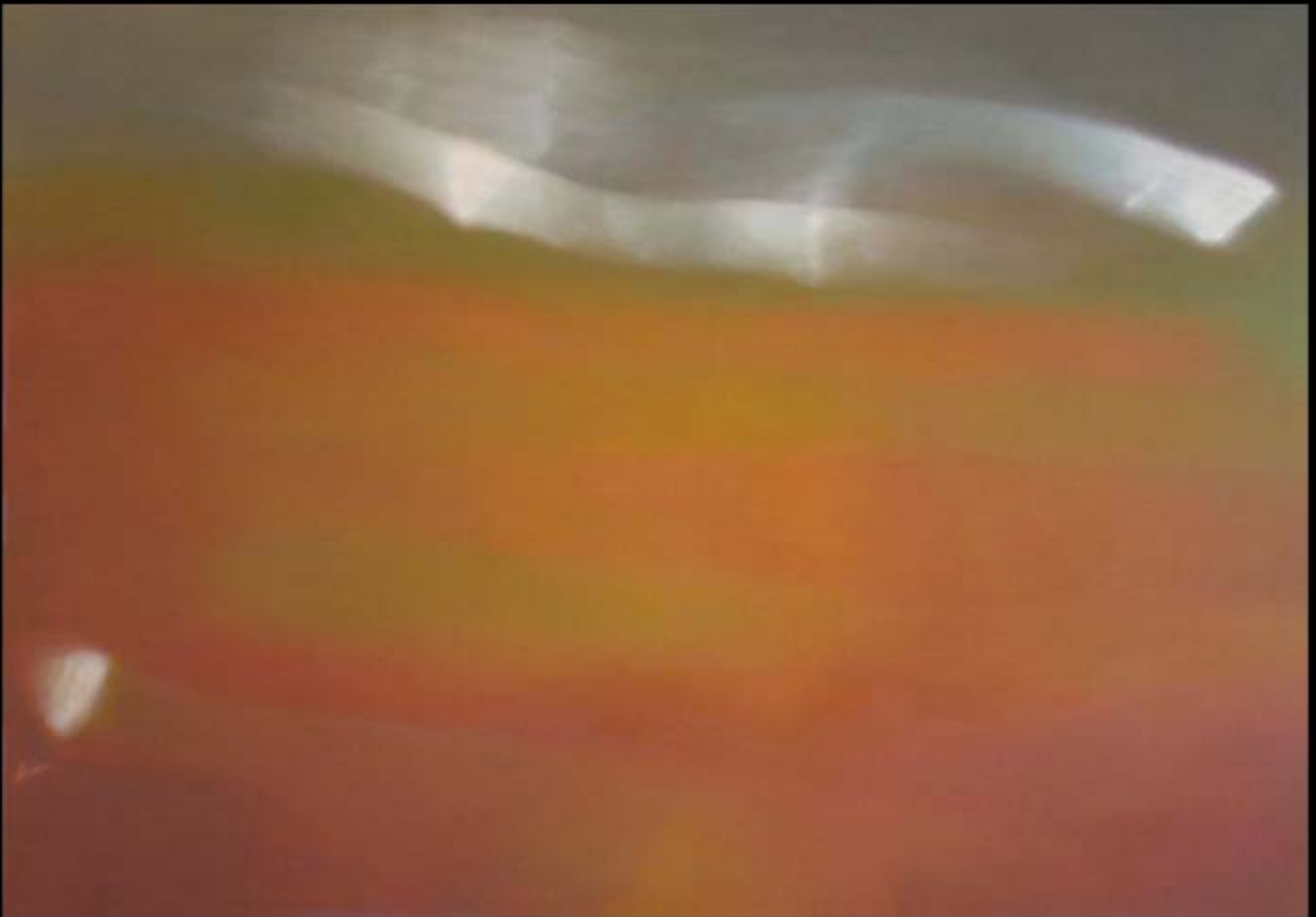
RR3 Oil on canvas 67"x45" 2007/08