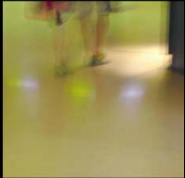
1M07 Chromogenic Print 22"x17" 2007/08