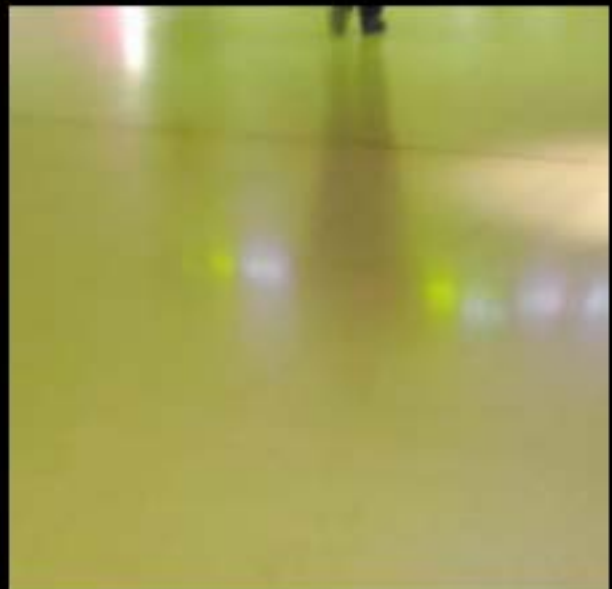
4M07 Chromogenic Print 22"x17" 2007/08