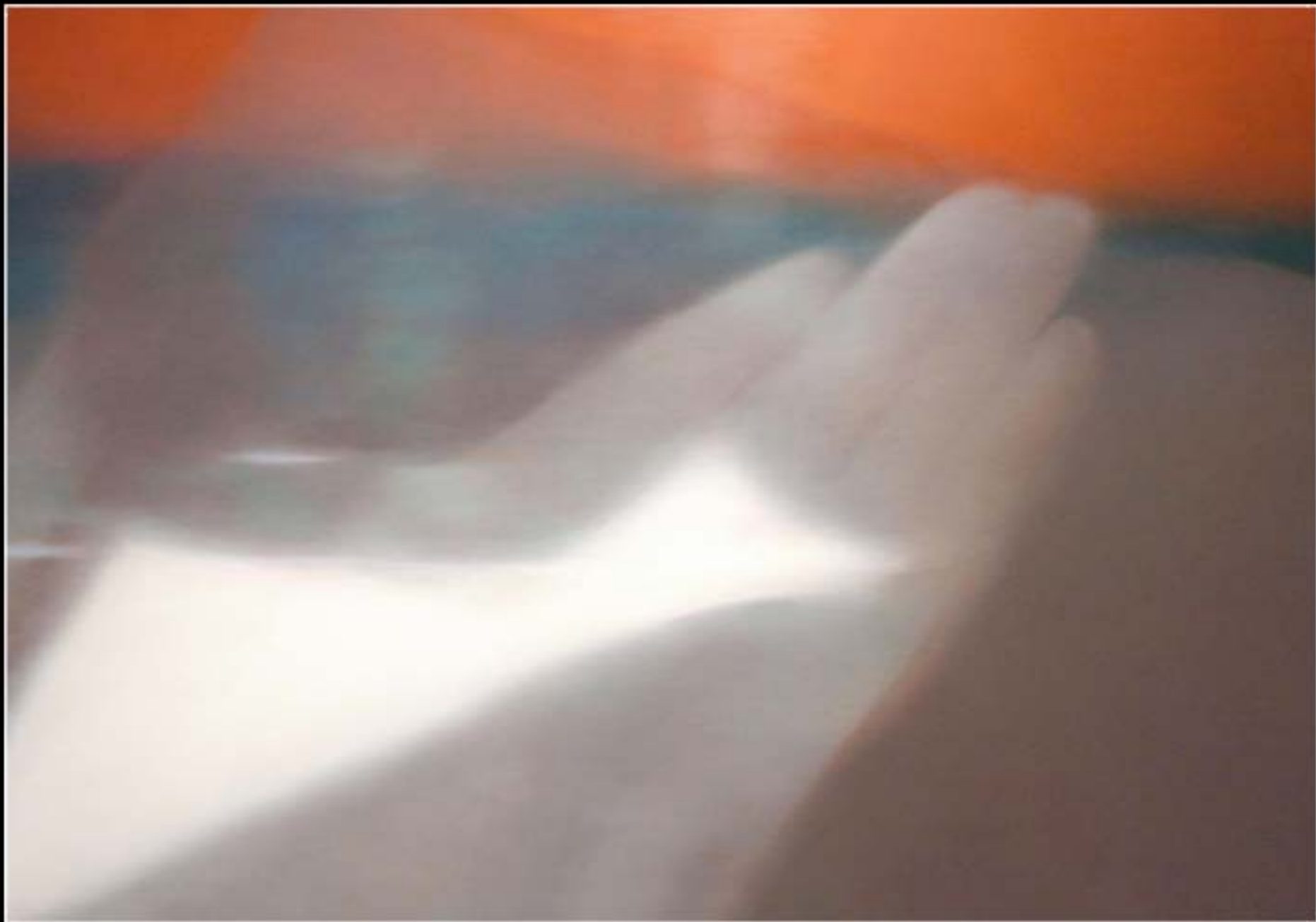
K3 Oil on canvas 51"x79" 2007/08