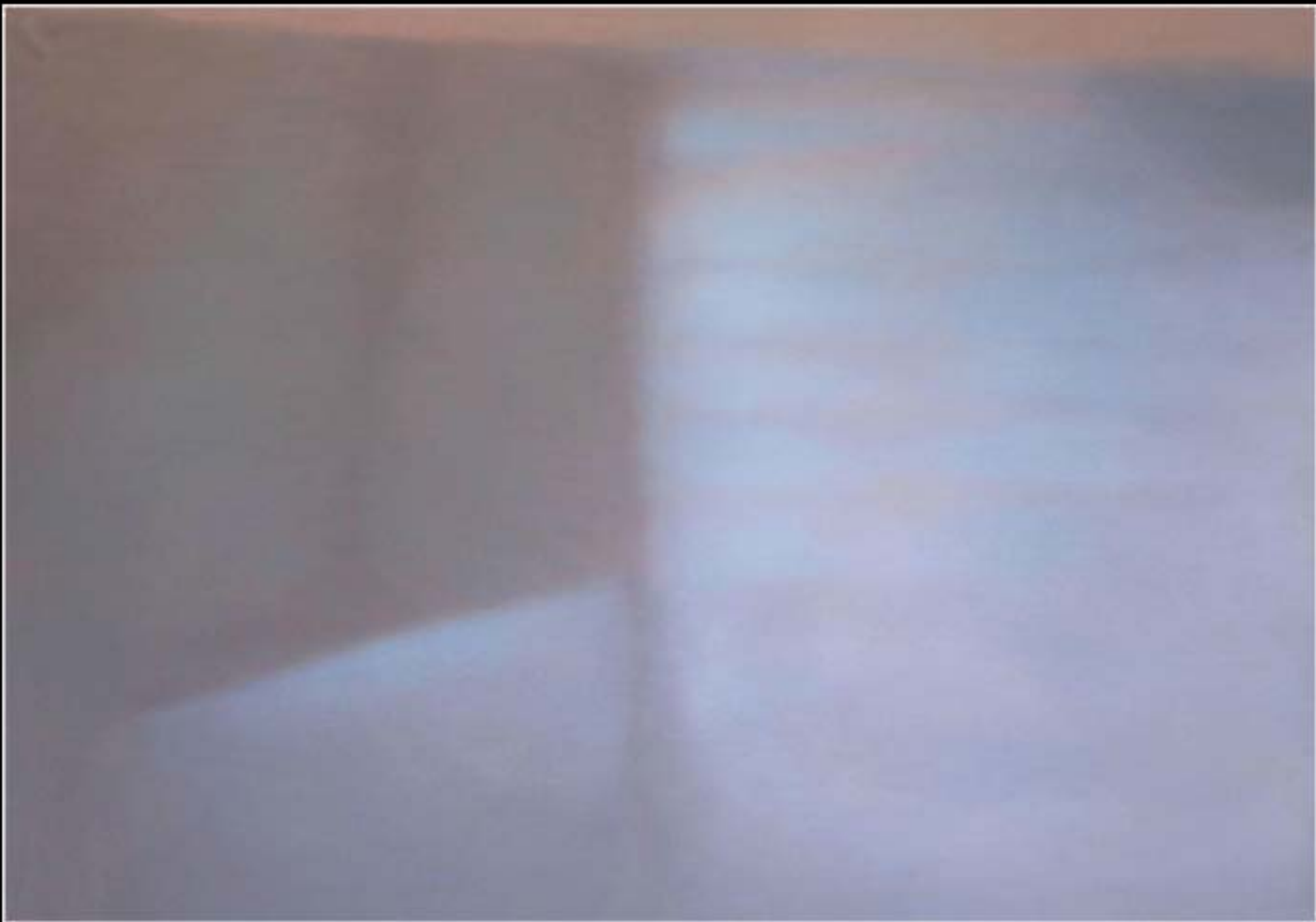
RR1 Oil on canvas 67"x45" 2007/08