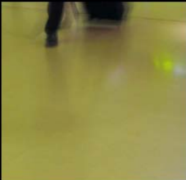
2M07 Chromogenic Print 22"x17" 2007/08