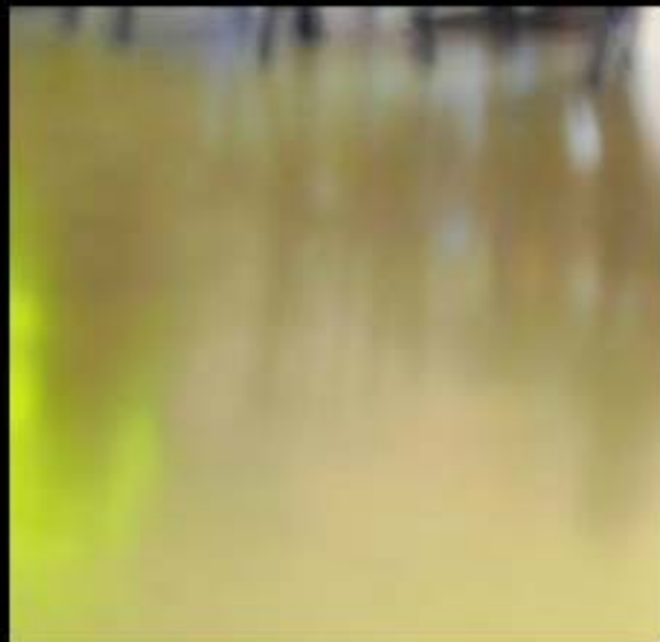
3M07 Chromogenic Print 22"x17" 2007/08