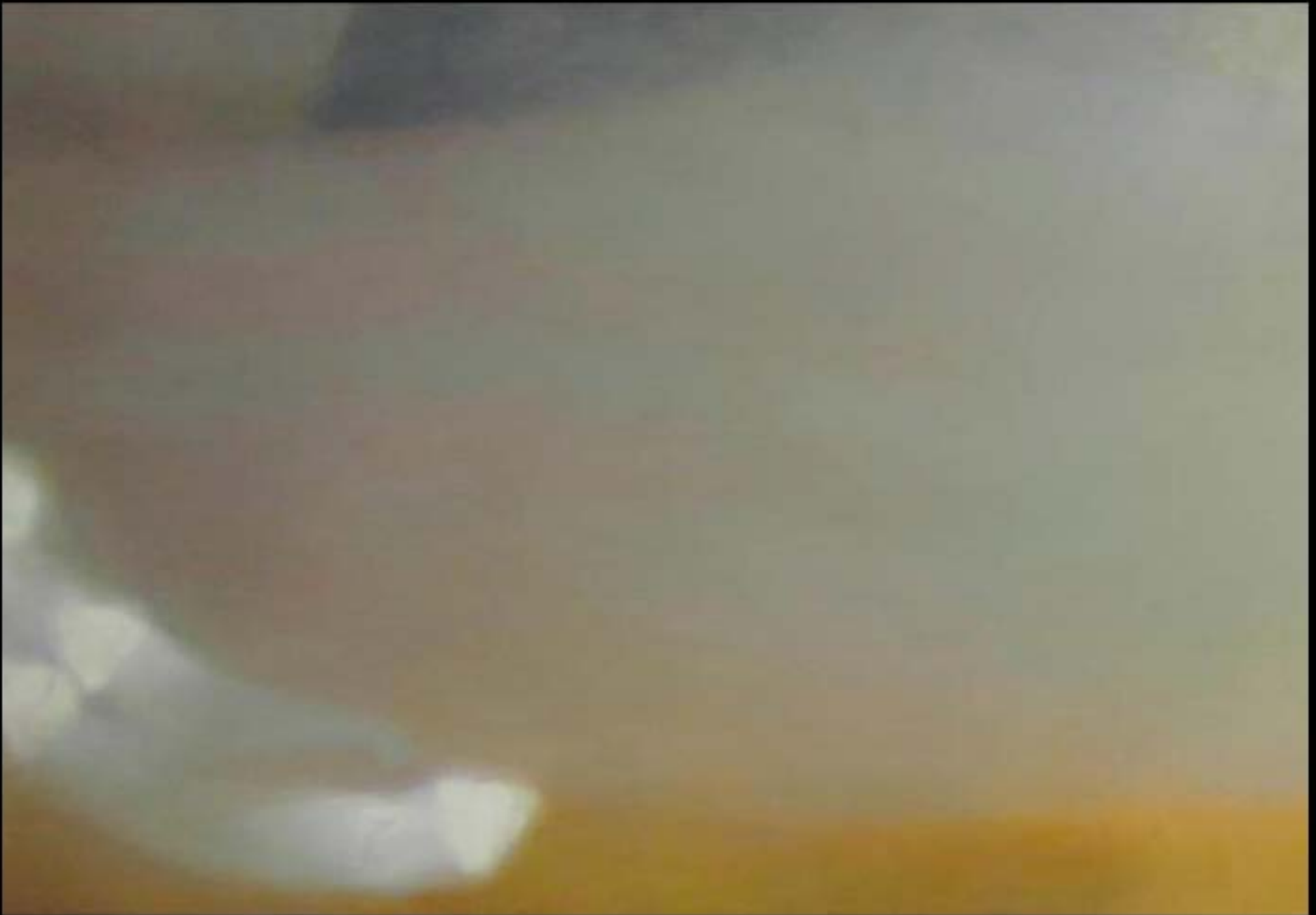
RR5 Oil on canvas 67"x45" 2007/08