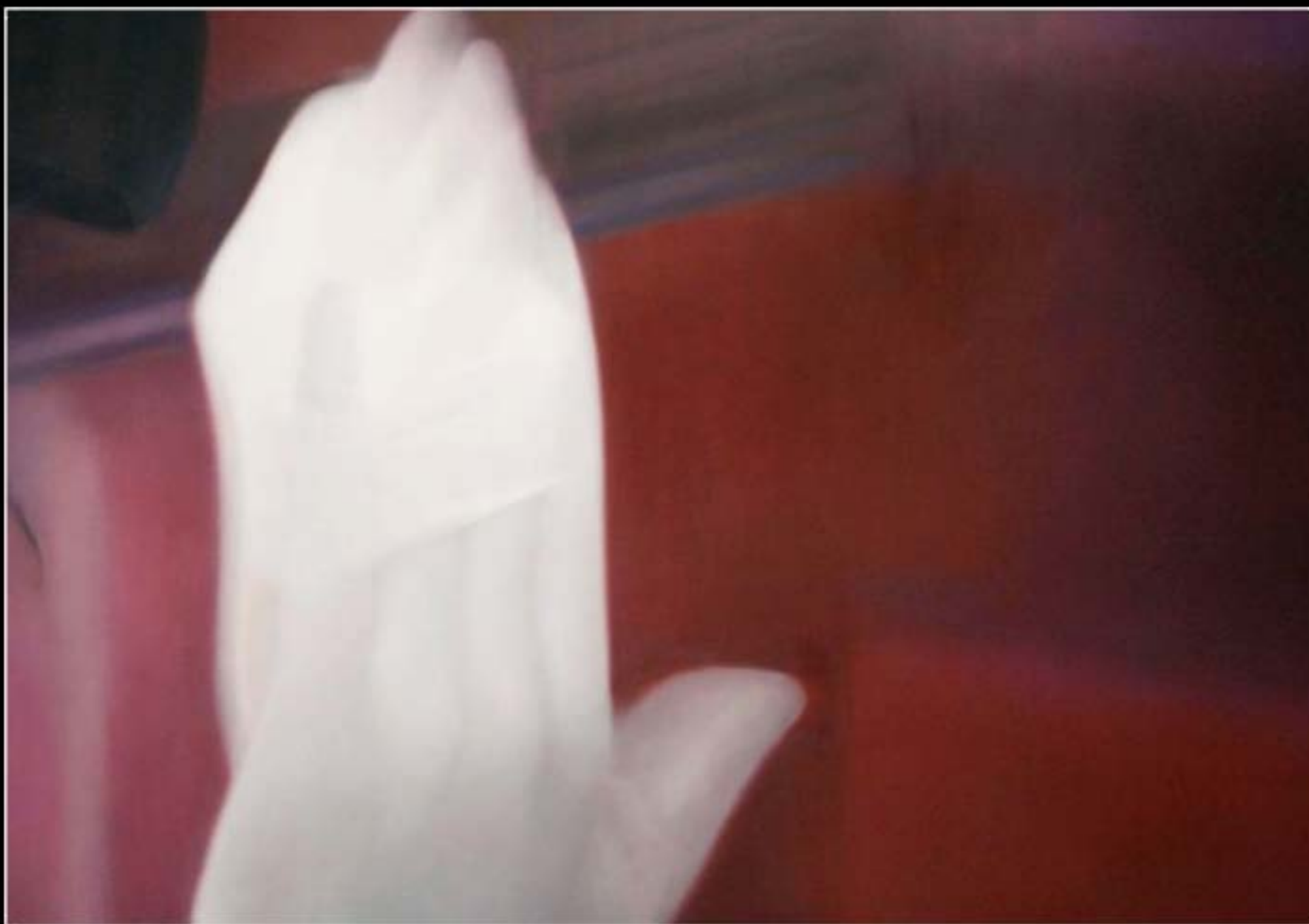
K6 Oil on canvas 51"x87" 2007/08