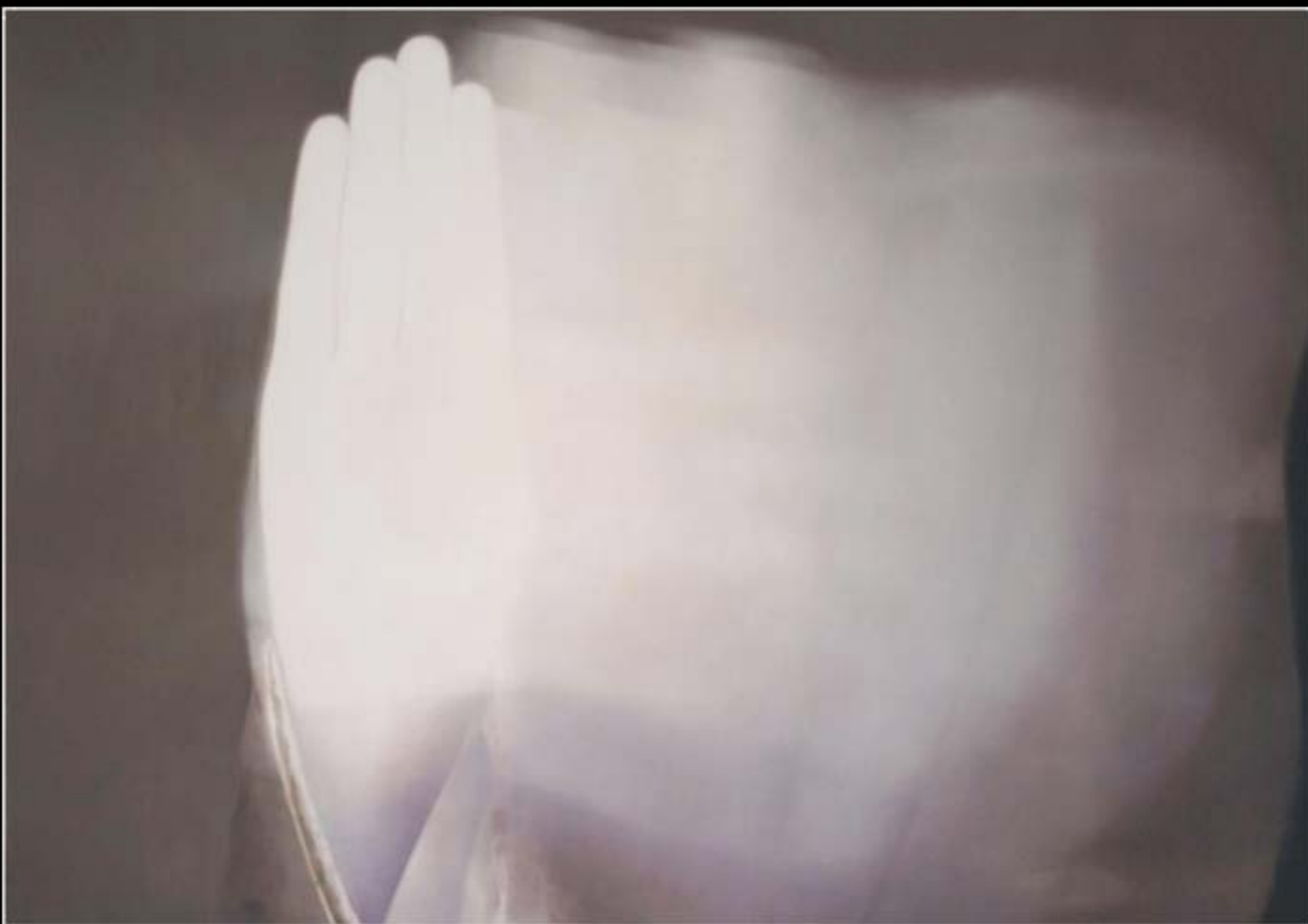
K7 Oil on canvas 75"x106" 2007/08