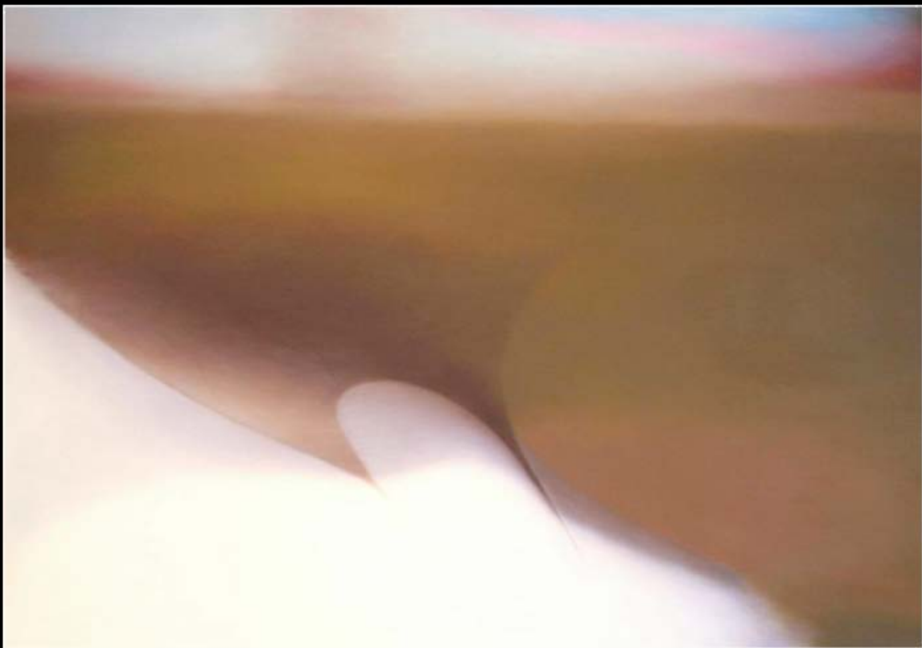
K4 Oil on canvas 51"x79" 2007/08