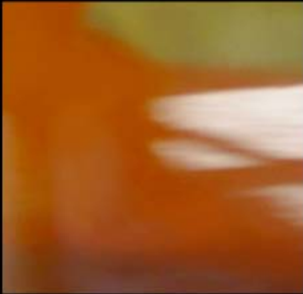
1-2 Chromogenic Print 24"x18" 2007/08