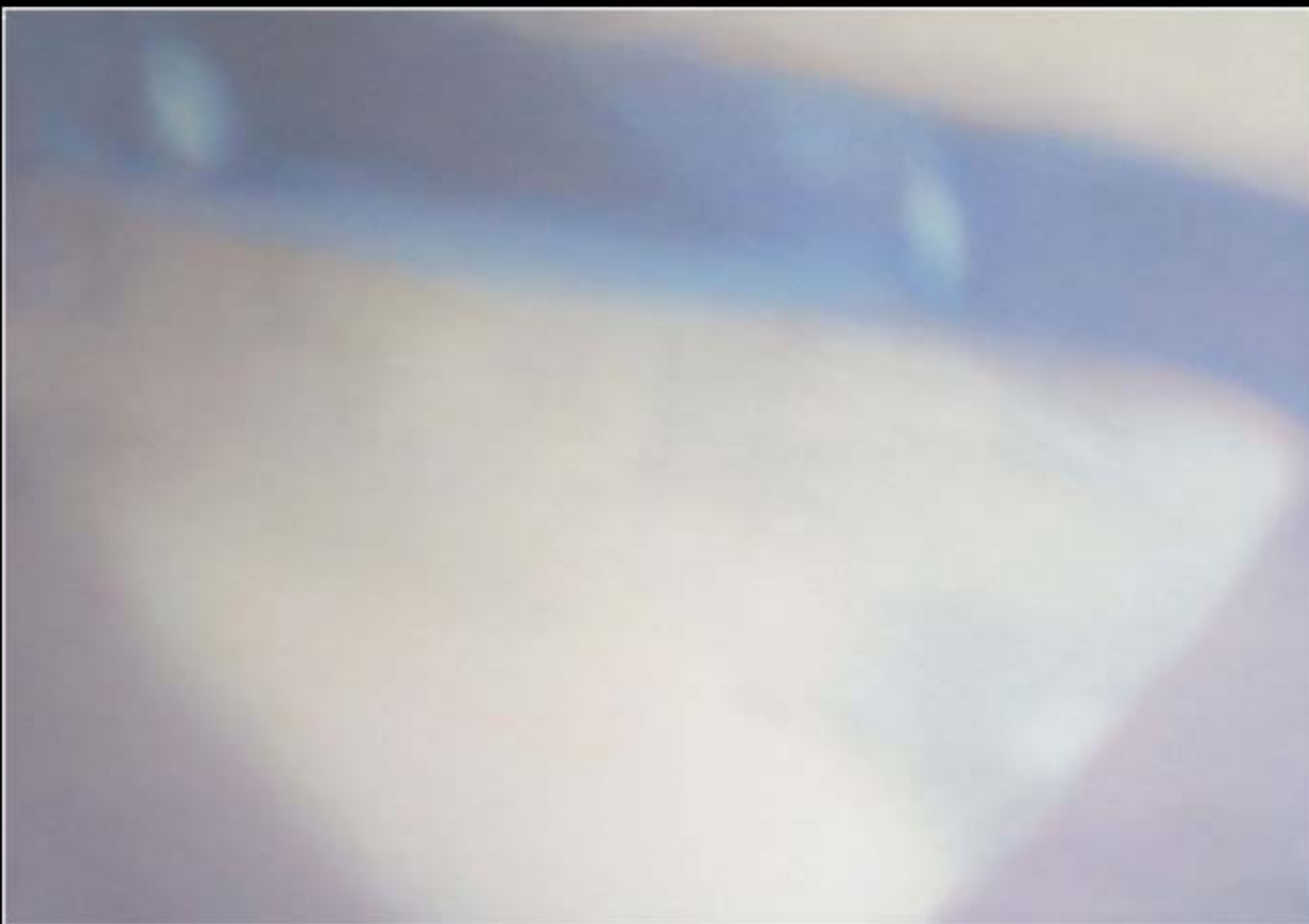
RR2 Oil on canvas 67"x45" 2007/08