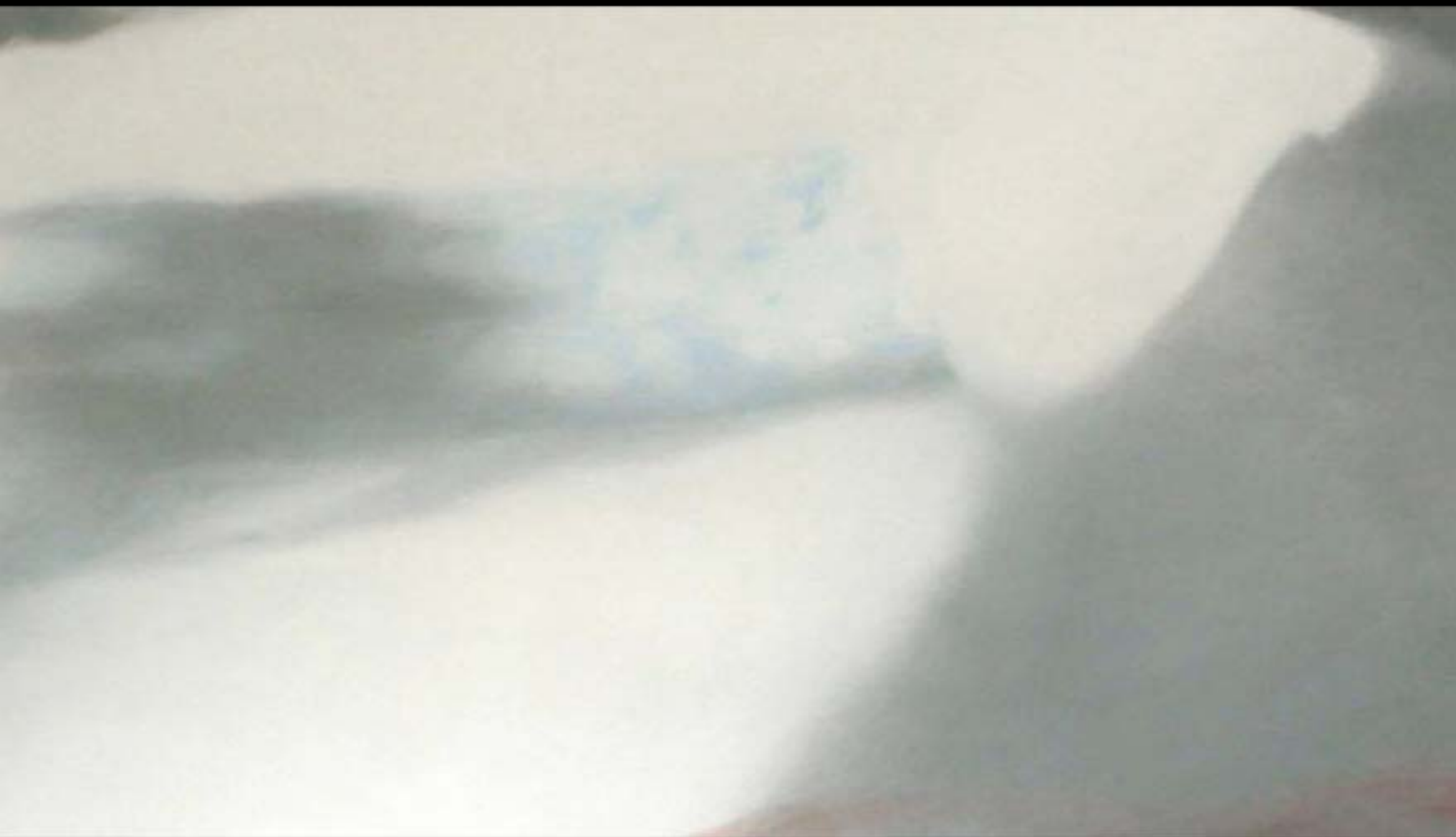
W12 Oil on canvas 24"x67" 2007/08