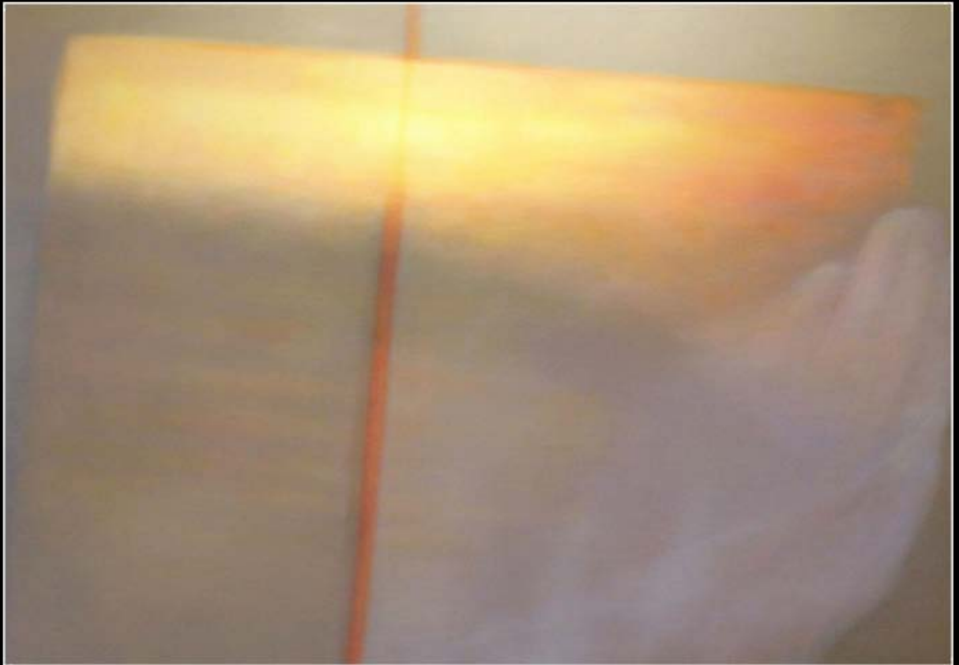
K1 Oil on canvas 51"x79" 2007/08