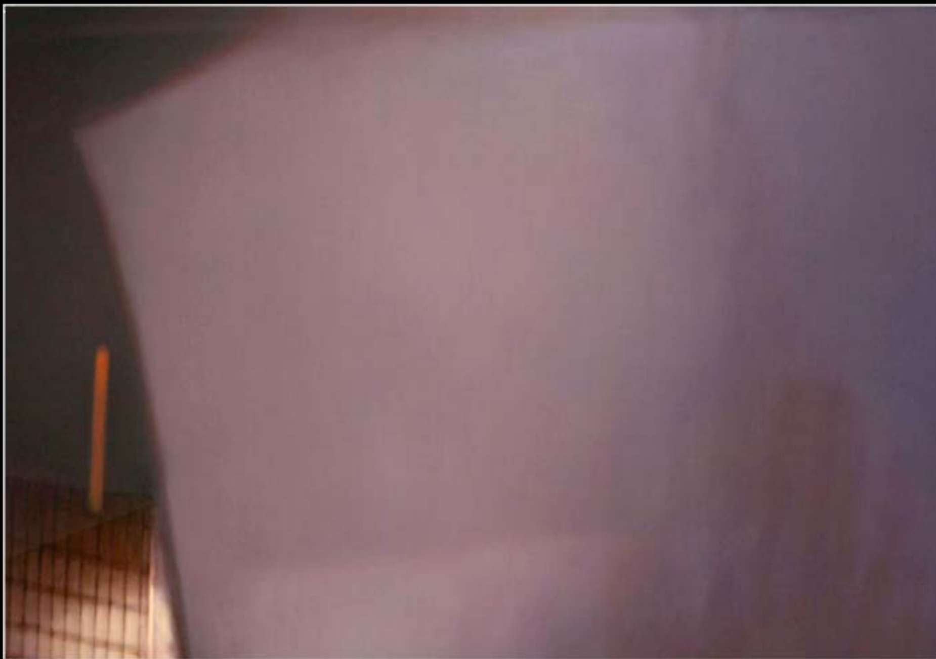
K5 Oil on canvas 51"x87" 2007/08