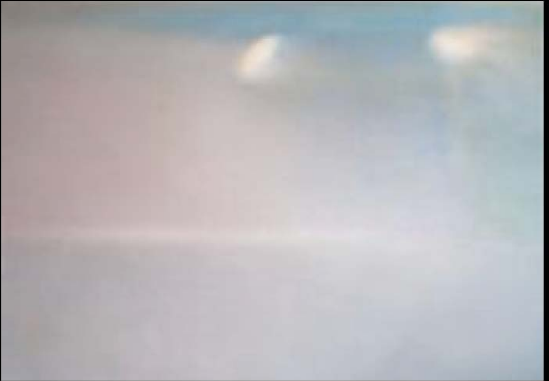
RR4 Oil on canvas 67"x45" 2007/08