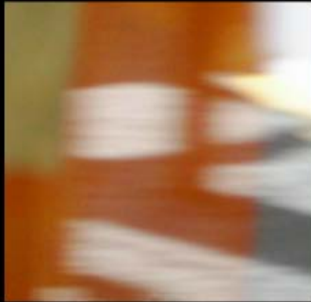
1-3 Chromogenic Print 24"x18" 2007/08